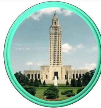
Louisiana State Capitol

The Police Jury Association is making some changes to save money and provide you with the most up-to-date information possible! We are excited to announce we will begin issuing only one magazine instead of two per year and begin sending an email newsletter each month. We will continue the commemorative After Convention Issue that features our President on the cover and the photos and summary from our Annual Convention's many informative events. The newsletter will be issued the last Thursday of every month except for December's issue which will be in the middle of the month due to everyone's holiday festivities.